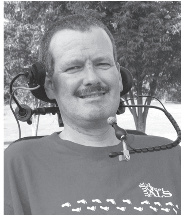
Personal Care Attendant Program